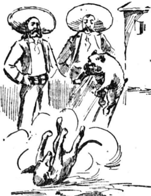
AN ENTIRELY INVOLUNTARY FLIGHT.

There was no necessity for the haste displayed by the spectators in reaching the seat of war, for the fray promised to be as long as it was sanguinary. No quarter was asked or desired. The stranger possessed a vast amount of staying power, inasmuch as when he once took hold little short of extraction.